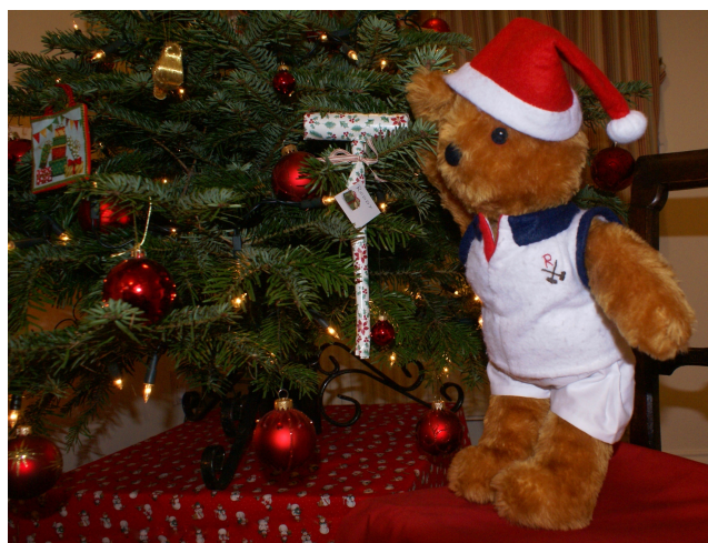
"Will anyone notice if I have a little peek?"